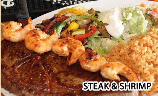
STEAK & SHRIMP