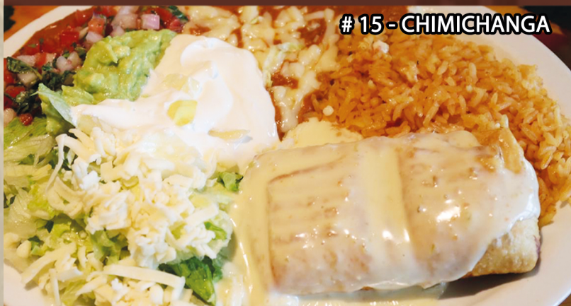
#15 - CHIMICHANGA