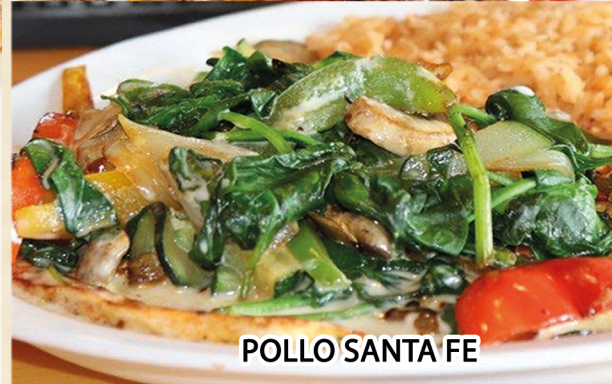
POLLO SANTA FE