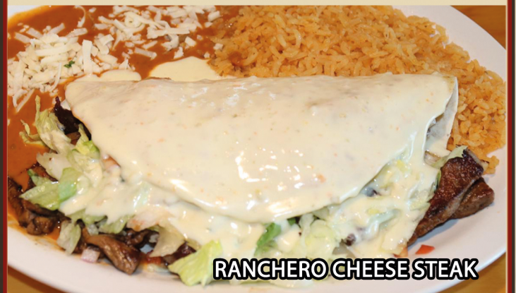
RANCHERO CHEESE STEAK

Shredded chicken chilaquiles with your choice of red or green salsa. Served with rice and salad. $10.99